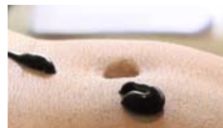
"Semper domestika mare/Inner sea everywhere", video 2012, Oleg Blyabyas