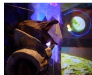
"Cosmos of Fish (Fish in the outer space)", multichannel audio-video installation, object - sculpture 2012, Anna Zaradny