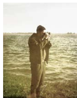
"I Picture the Island", photograph 2012, Johan Thurfjell