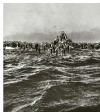
"Deadline", collage, Patrycja Orzechowska